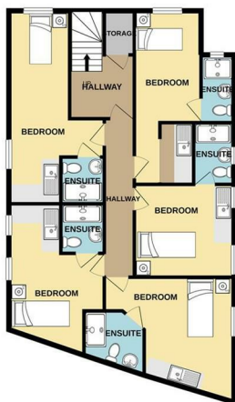
BASEMENT 982 sq.ft. (91.3 sq.m.) approx.