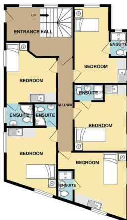
GROUND FLOOR 981 sq.ft. (91.1 sq.m.) approx.